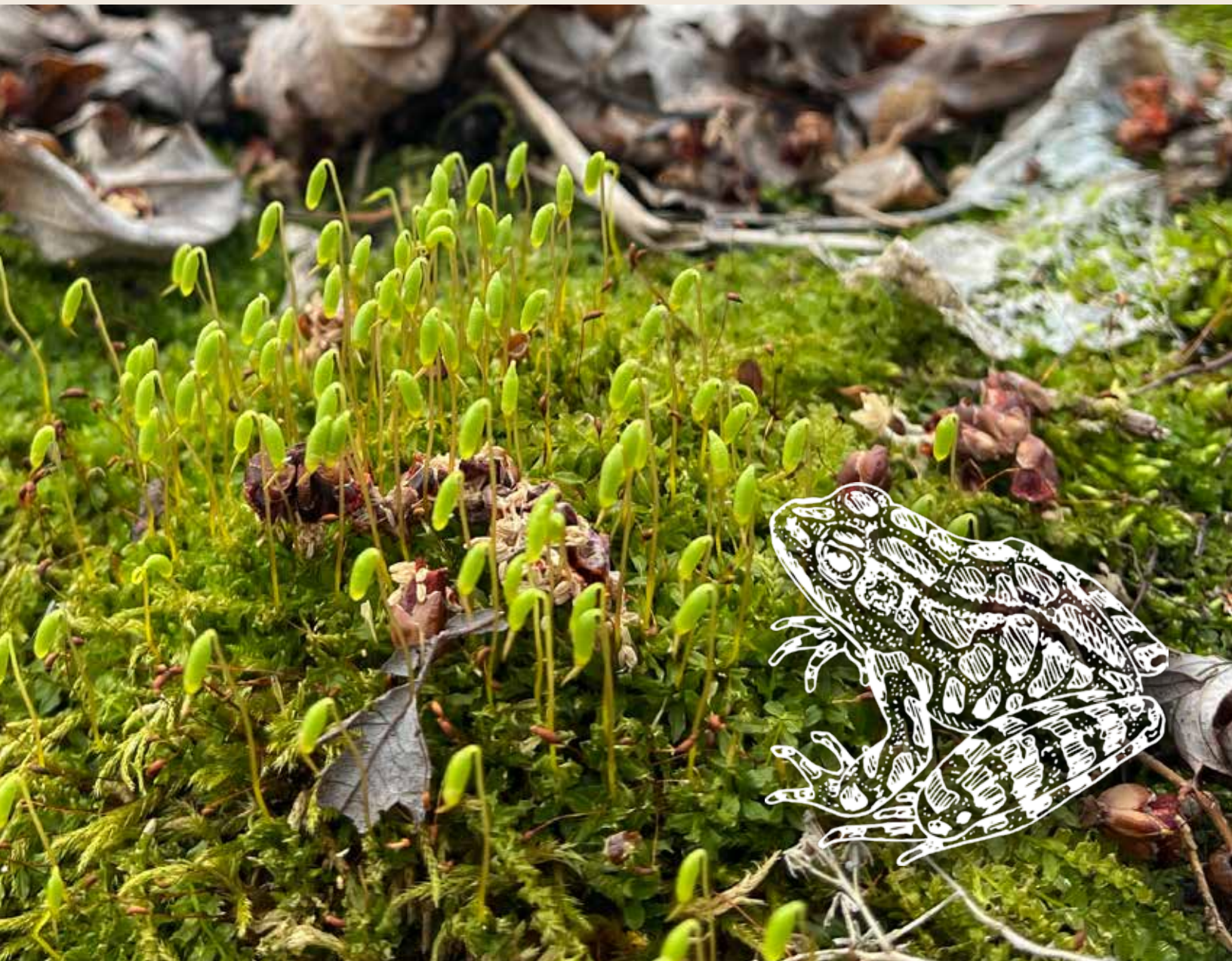
Spring Growth in Coon Rapids Dam Regional Park